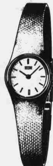
No. YL124M - $250.00. Yellow top/stainless steel back, gilt dial, HARDLEX mar-resist crystal.