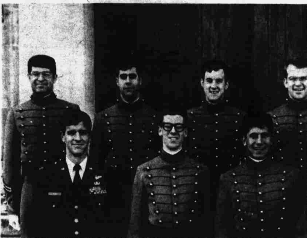
JEWISH MILITARY CHORUS AT WEST POINT.

"Additionally, I would like to know what steps can be taken to alleviate the situation," Laxalt said, noting, "It appears the problems are more critical in the area than elsewhere in the nation."