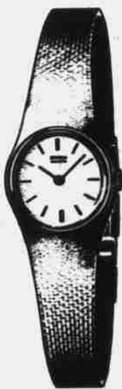
No. YL124M - $250.00. Yellow top/stainless steel back, gilt dial, HARDLEX mar-resist crystal.