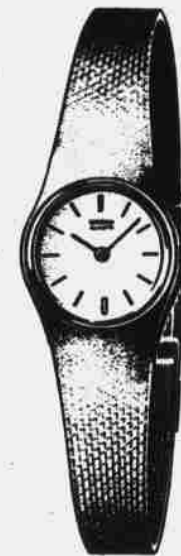
No. YL124M-$250.00. Yellow top/stainless steel back, gilt dial, HARDLEX mar-resist crystal.