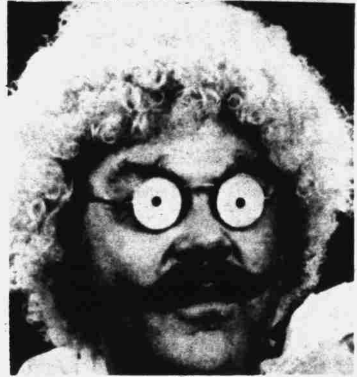
Rip past three seasons, he can make 'em proof enough that laugh.

Rip Taylor has been named Las Vegas "Entertainer of the Year" for the