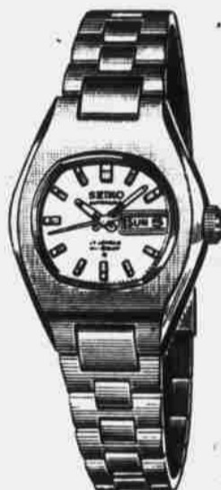
No. YP098M—$150.00. 17j, 100 feet water tested, yellow top/stainless steel back, gilt dial.