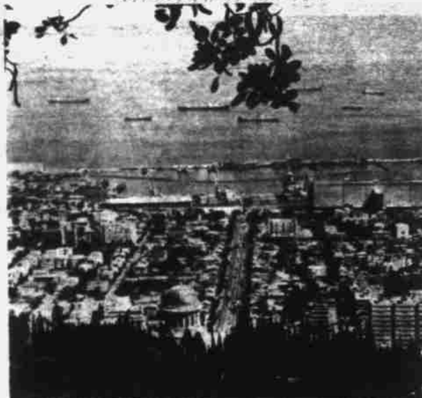
MORE THAN 54,000 CRUISE-PASSENGERS VISITED ISRAEL DURING THE FIRST SEVEN MONTHS OF 1977, MANY LANDING IN THE MEDITERRANEAN PORT - CITY OF HAIFA (SHOWN ABOVE), WHICH IS ONLY A FEW HOURS DRIVE FROM JERUSALEM OR THE SEA OF GALILEE.

UNITED NATIONS (WUP) -- All indications here now point to an all-out Arab-Soviet anti-Israeli onslaught to be launched during the 32nd