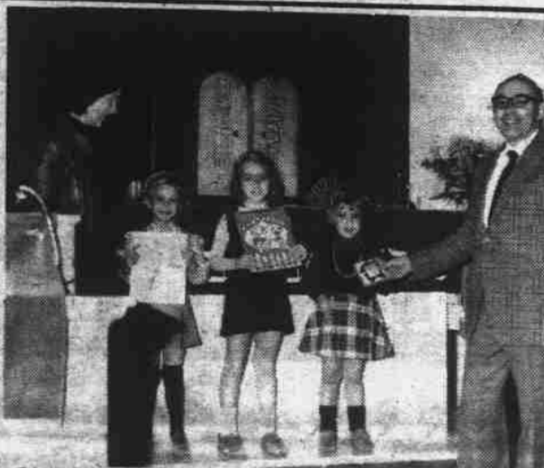
CHILDREN OF JEWISH MILITARY PERSONNEL STATIONED IN LIVORNO, ITALY, RECEIVE HANUKKAH GIFTS SENT BY JWB'S WOMEN'S ORGANIZATIONS' SERVICES AND DISTRIBUTED BY JEWISH MILITARY LAY LEADERS.

Oneg Shabbat refreshments in the Temple's Entratter Social Hall immediately after the conclusion of Services.