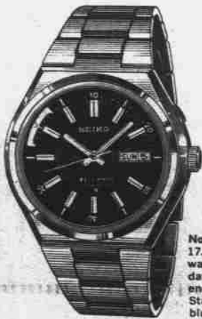
No. AJ075M--$145.00. 17J, self-winding, 98.2 ft. water tested, instant date setting day/date calendar, adjustable bracelet. Stainless steel, teal blue dial.

SEIKO HAS A SOUND WAY OF KEEPING THE BUSY EXECUTIVE ON TIME.