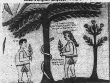
Adam & Eve - 1 of 7 Shalom of Safed prints free with a Jerusalem Post subscription

WEEKLY OVERSEAS EDITION Israel's English-language newspaper