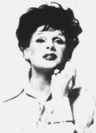
JIM BAILEY (AS JUDY GARLAND), ONE OF THE SUPERB IMPERSONATIONS HE CREATED, IN THE JERRY LEWIS SHOW AT THE SAHARA UNTIL AUG. 27.

NOTES FROM ALL OVER..... Hilarious impressionist-comedian CHARLES PIERCE, winner of the New York OBIE AWARD for his first engagement at the Top of the Village Gate earlier this year, now at the Cabaret in Los Angeles where he has been held over six times!!..... JAMES DARREN is being paged to replace New Zealand singer JOHN ROWLES (who's going on holiday) as star of