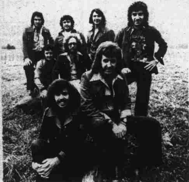
OAK RIDGE BOYS, THE NUMBER ONE GOSPEL SINGER GROUP, FEATURED IN "COUNTRY MUSIC U.S.A." AT THE LANDMARK.