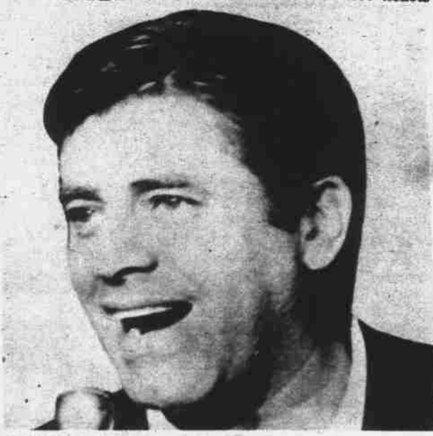
JERRY LEWIS STARS IN THE SAHARA CONGO ROOM, WITH CHARO AS SUPPORTING ACT.

For a truly wonderful record trip, go buy BARBARA COOK AT CARNEGIE HALL on Columbia Records. Barbara, in case you