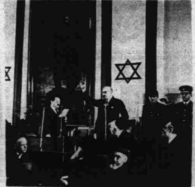
DR. WEIZMANN TAKING THE PRESIDENTIAL OATH ADMINISTERED BY MR. JOSEPH SPRINTZAK, SPEAKER OF THE KNESSET.