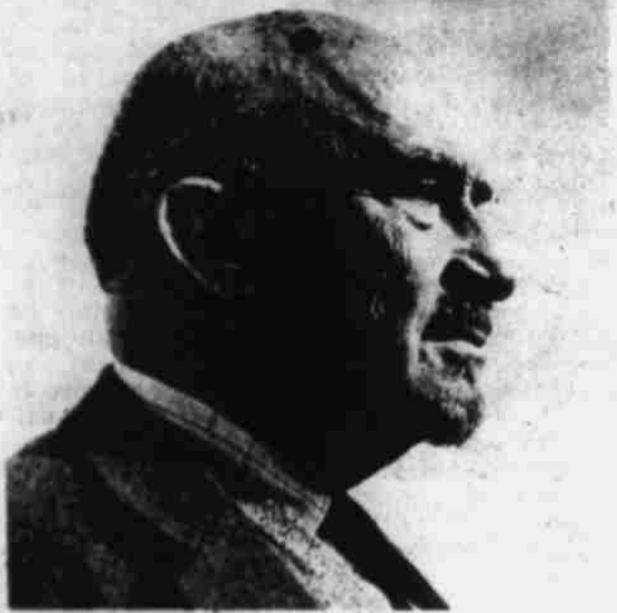
THE LAST PORTRAIT OF DR. CHAIM WEIZMANN TAKEN AFTER HE ASSUMED OFFICE AS THE FIRST PRESIDENT OF THE STATE OF ISRAEL.