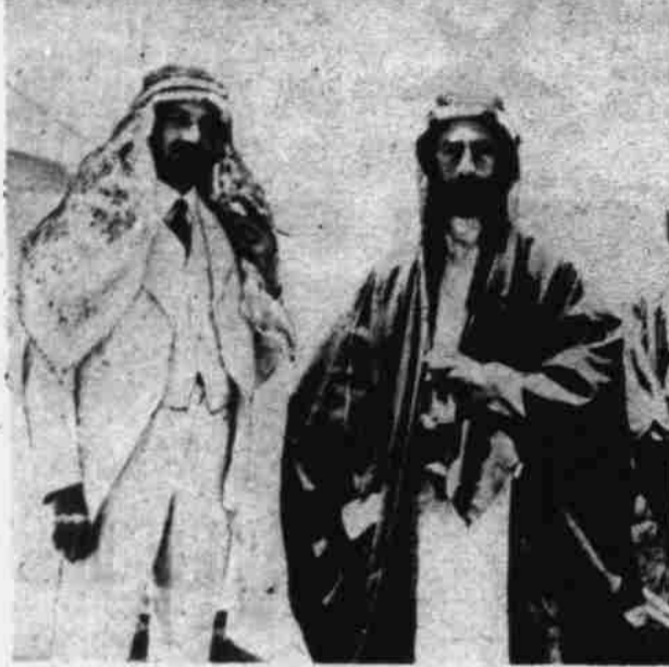
THE HISTORICAL MEETING BETWEEN DR. WEIZMANN AND THE EMIR (LATER KING) FEISAL OF IRAQ, AT AQABA IN 1918.