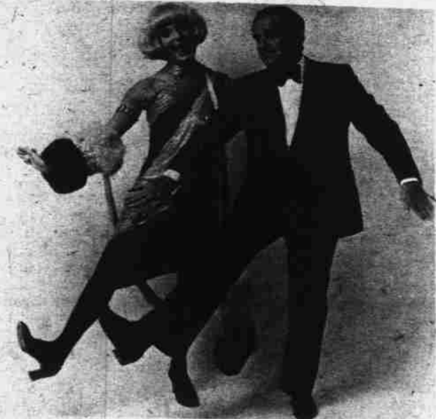
ALAN KING AND CAROL CHANNING STAR AT CAESARS PALACE THROUGH NOVEMBER 27. THIS REPRESENTS ONE OF THE MOST POTENT ONE-TWO PUNCHES EVER TOSSED AT THE PUBLIC IN THE ENTERTAINMENT CAPITAL.