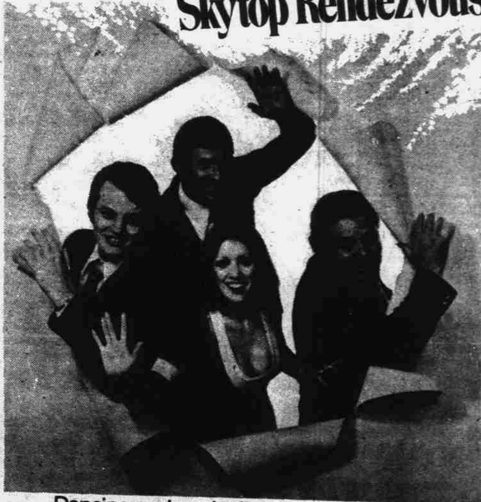
Dancing and cocktails on the 31st floor Entertainment from 9:30 to 3:30 p.m.