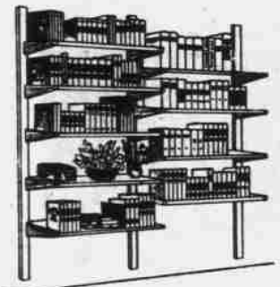
The Library wall In American walnut

Now SAVE 30% In Burmese teak Now SAVE 35% East Indian rosewood Now SAVE 50%