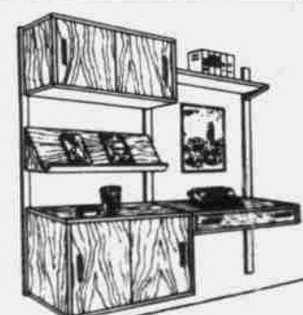
Study/storage wall In American walnut

Now SAVE 30% In Burmese teak Now SAVE 35% East Indian rosewood Now SAVE 50%