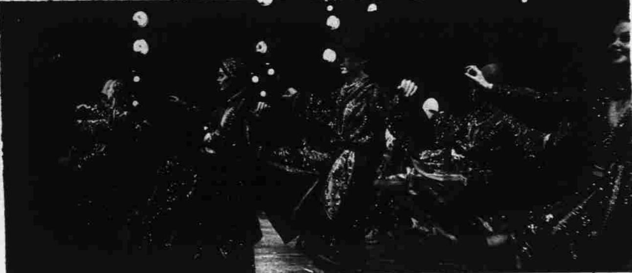
THE 25TH ANNIVERSARY OF THE STATE OF ISRAEL IS ENACTED IN FREDERIC APCAR'S "CASINO DE PARIS" AT THE DUNES HOTEL AND COUNTRY CLUB. THE