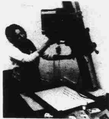
1970. Hadassah opens Israel's first 2-year Community College, and merges girls' and boys' high schools to create co-educational, comprehensive high school. College student, above, came from Russia. Hadassah Vocational Guidance Institute provides educational and vocational testing and counselling.