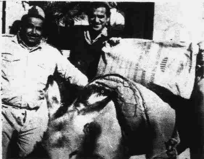
1973. Hadassah is U.S. agent for distribution of American "Food for Freedom" to schools and institutions in Israel.