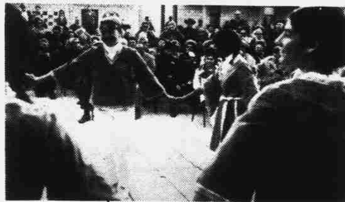
1973. To help deprived urban youth, Hadassah is opening many Youth Aliyah all-day centers in densely populated areas.