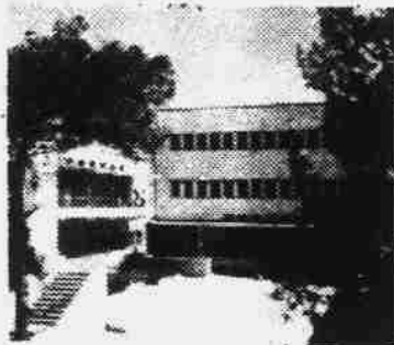
1964. New Seligsberg School opens. Vocational training broadens for more sophisticated career orientation.