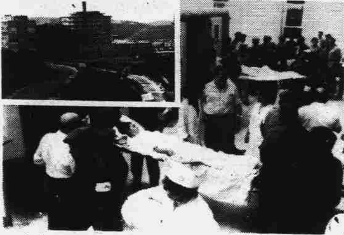
1948 - June 6. Operation Moving Day! Scattered throughout Jerusalem since 1948, Hadassah moves to new Medical Center at Lin Karem. Medical care continues even as Army pitches in and moves patients, personnel and supplies.