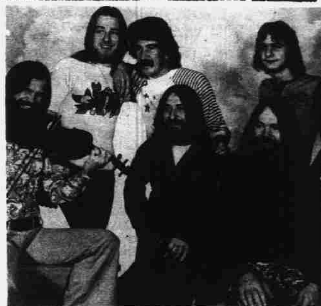
"IT CAME TO PASS", OUTSTANDING VERSATILE, MUSICAL GROUP SENSATION, RECENTLY COMPLETED ENGAGEMENT IN "THE BARGE" AT CAESAR'S PALACE. NEXT, A MAJOR CONCERT TOUR.