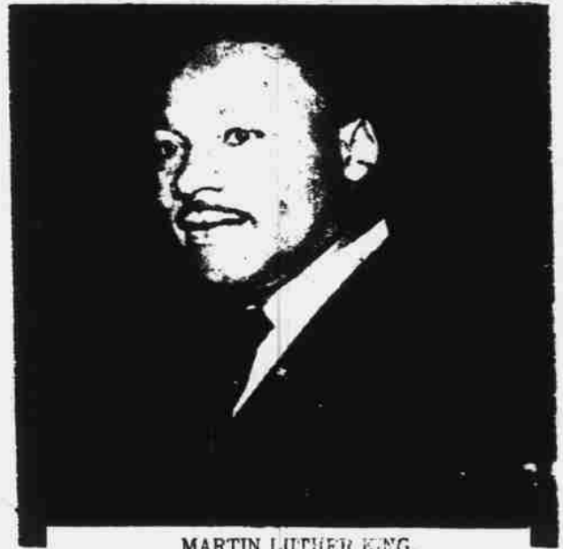
MARTIN LUTHER KING

A special three-hour "Salute to Dr. Martin Luther King, Jr." will be aired by local radio station KVOV (1280kc.) from 1 to 4 p.m. on April 4 commemorating the fourth anniversary of the assassination of the noted civil rights leader who was awarded the 1964 Nobel Peace Prize.