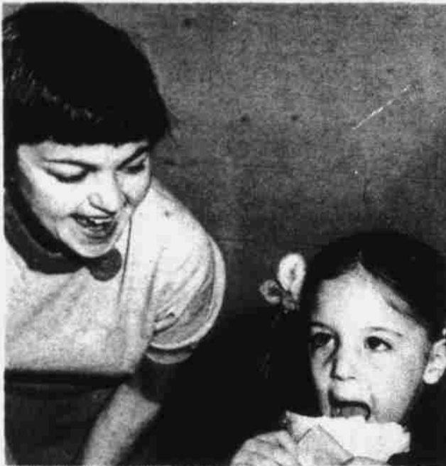
PRE-SCHOOLER OF THE CLEVELAND JEWISH COMMUNITY CENTER, AN AFFILIATE OF THE NATIONAL JEWISH WELFARE BOARD, DOES MORE THAN SAMPLE THE MATZAH SHE BAKED AT THE CENTER. LIKE YOUNGSTERS IN OTHER CENTERS, SHE IMBIBES KNOWLEDGE FROM THE EARLY CHILDHOOD EDUCATOR ABOUT THE RELATION OF HER OWN LIFE TO THE FLIGHT OF THE JEWS FROM SLAVERY TO FREEDOM AND TO ISRAEL.

IF YOUR BUSINESS CANNOT AFFORD TO ADVERTISE THEN ADVERTISE IT FOR SALE IN THE LAS VEGAS ISRAELITE.