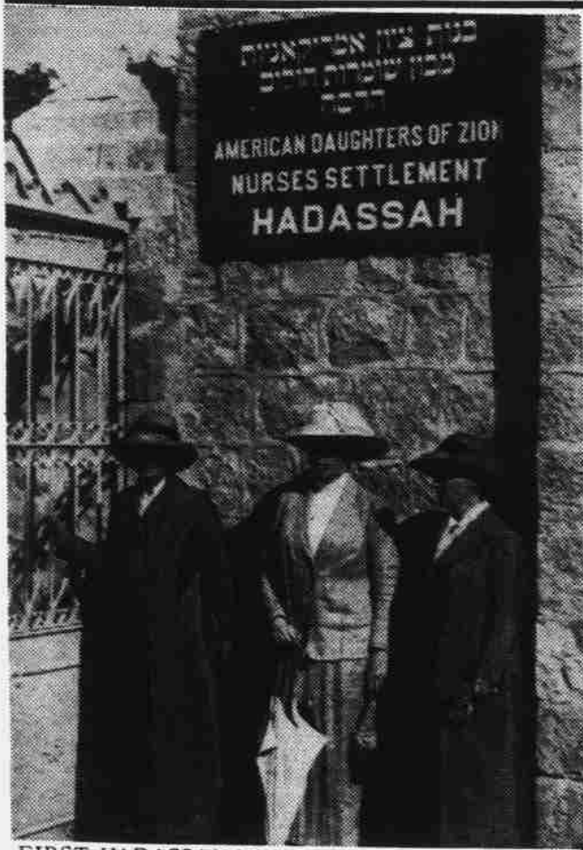
FIRST HADASSAH NURSES ARRIVE IN JERUSALEM - 1912. THEY ESTABLISHED A MATERNITY STATION.