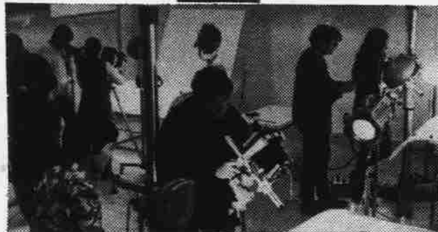
THE COMMUNITY COLLEGE -- 1971. FIRST OF ITS KIND IN ISRAEL, IT PROVIDES TWO-YEAR CAREER TRAINING IN THE MUCH NEEDED SCIENTIFIC AND TECHNOLOGICAL FIELDS. HADASSAH WOMEN RAISE OVER $18 MILLION TO SUPPORT THESE VARIED PROGRAMS IN ISRAEL, WHICH INCLUDE THE SINGLE LARGEST CONTRIBUTION TO THE JEWISH NATIONAL FUND FOR ITS LAND RECLAMATION AND DEVELOPMENT PROJECTS.