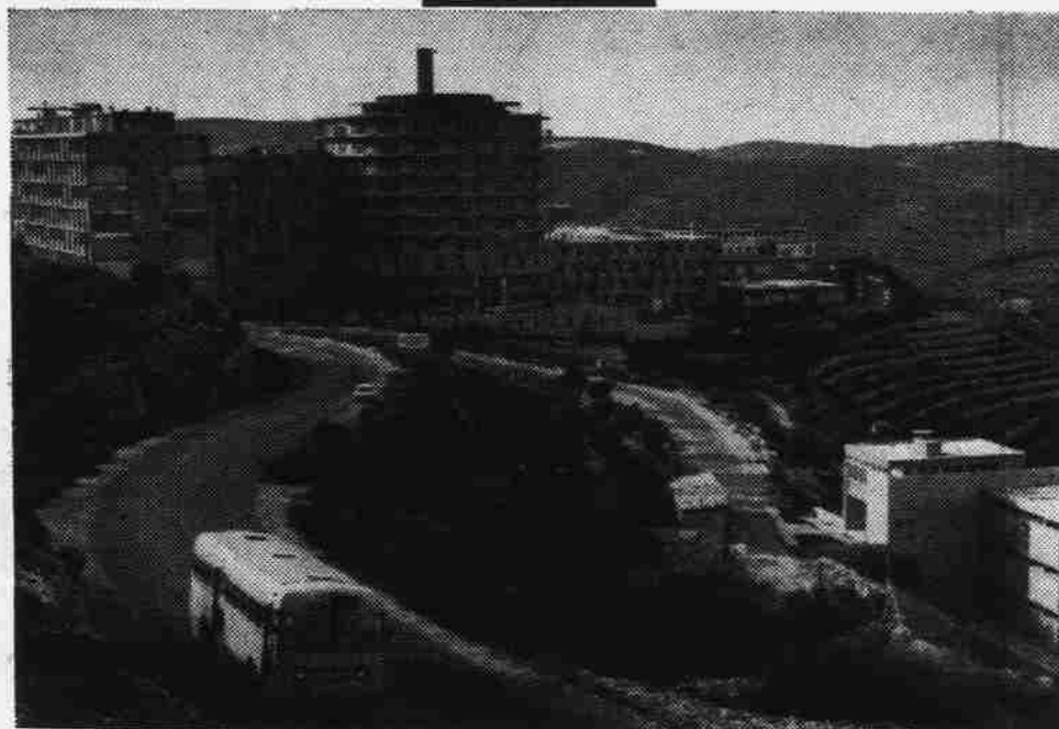
EIN KAREM -- 1960. THE HADASSAH-HEBREW UNIVERSITY MEDICAL CENTER AT EIN KAREM OPENED IN 1960. A CENTER OF HEALING, TEACHING AND RESEARCH, IT IS THE LARGEST AND MOST MODERN MEDICAL COMPLEX IN THE ENTIRE MIDDLE EAST.