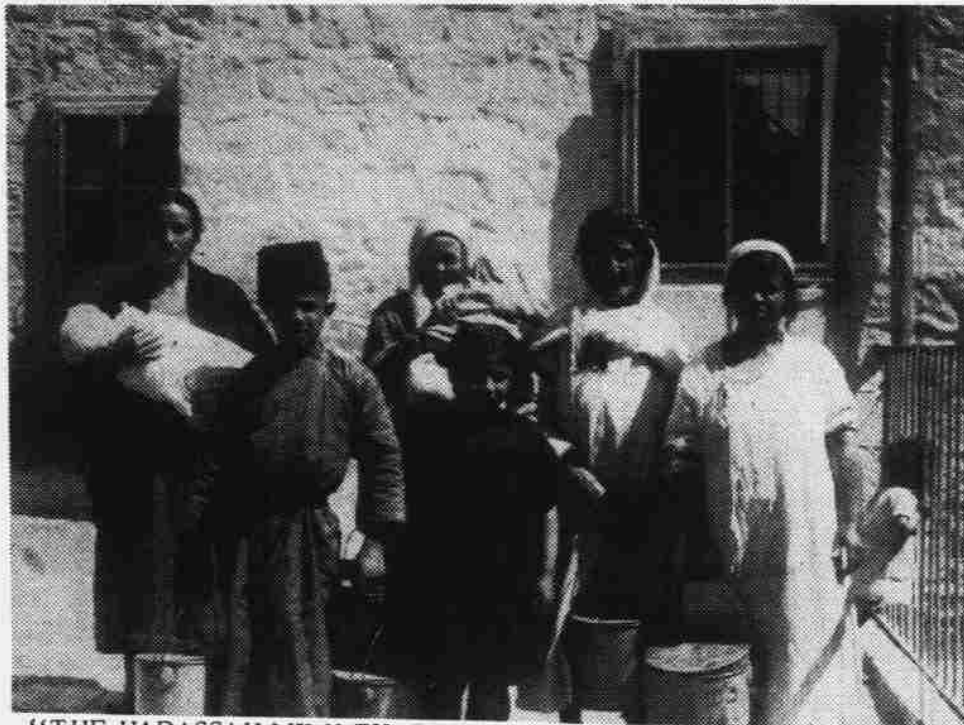
"THE HADASSAH MILK EXPRESS - 1921." FRESH MILK DELIVERED DAILY IN SANITARY CONTAINERS STARTED THOUSANDS OF MALNOURISHED INFANTS AND CHILDREN ON THE ROAD TO HEALTH.