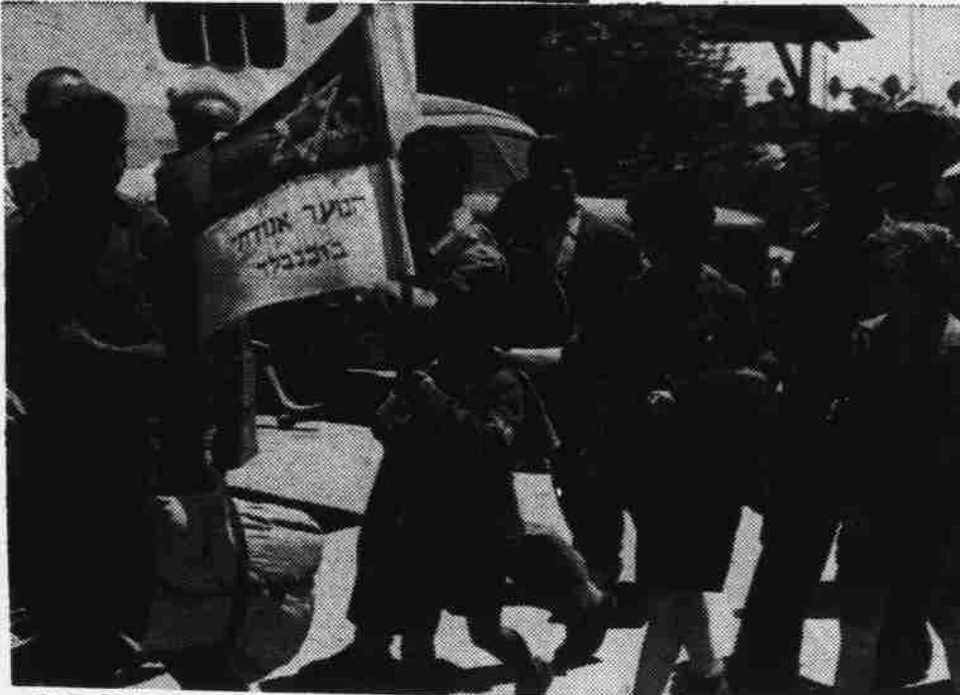
THE BUCHENWALD CHILDREN -- 1945. THESE WERE THE FIRST CHILDREN FROM THE GRISLY EXTERMINATION CAMP, ON THEIR ARRIVAL IN ISRAEL.