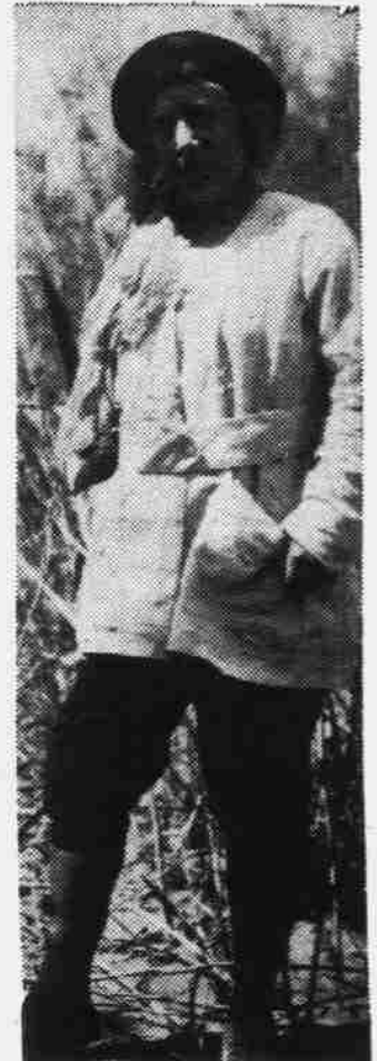
HENRIETTA SZOLDAT 60 - PALESTINE, 1920. BALTIMORE GENTLEWOMAN, EDUCATOR-SOCIAL WORKER, SCHOLAR, FOUNDER OF HADASSAH WOULD BE CONSIDERED "LIBERATED" IN ANY ERA.