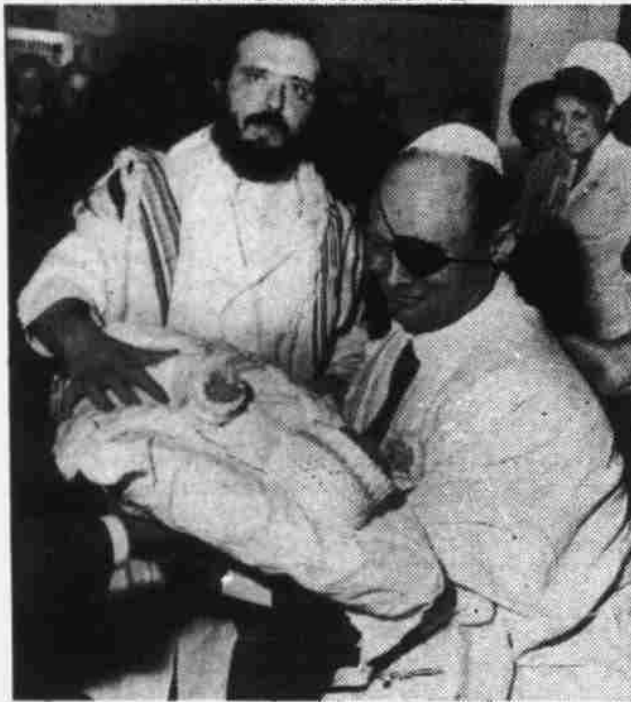
ISRAELI DEFENSE MINISTER MOSHE DAYAN AT HADASSAH-HEBREW UNIVERSITY MEDICAL CENTER, WHERE HE WAS SANDAK AT THE BRIT MALA OF A SON BORN TO A MEMBER OF HIS STAFF.

NEW YORK (WNS)--Two members of the Jewish Defense League were sentenced to three month jail terms and 14 others were fined from $600 to $800 each for damaging the offices of the New York Board of Rabbis last summer.