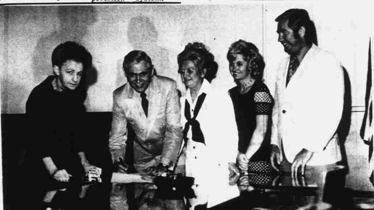
MAYOR ORAN GRAGSON HAS OFFICIALLY FILED FOR REELECTION AS MAYOR OF LAS VEGAS, LOOKING ON AS THE MAYOR SIGNS OFFICIAL DOCUMENTS AND PAYS HIS

the American Nuclear Asked the reason for Society, having an entering the Mayor's interest in Ecology, also race without previous