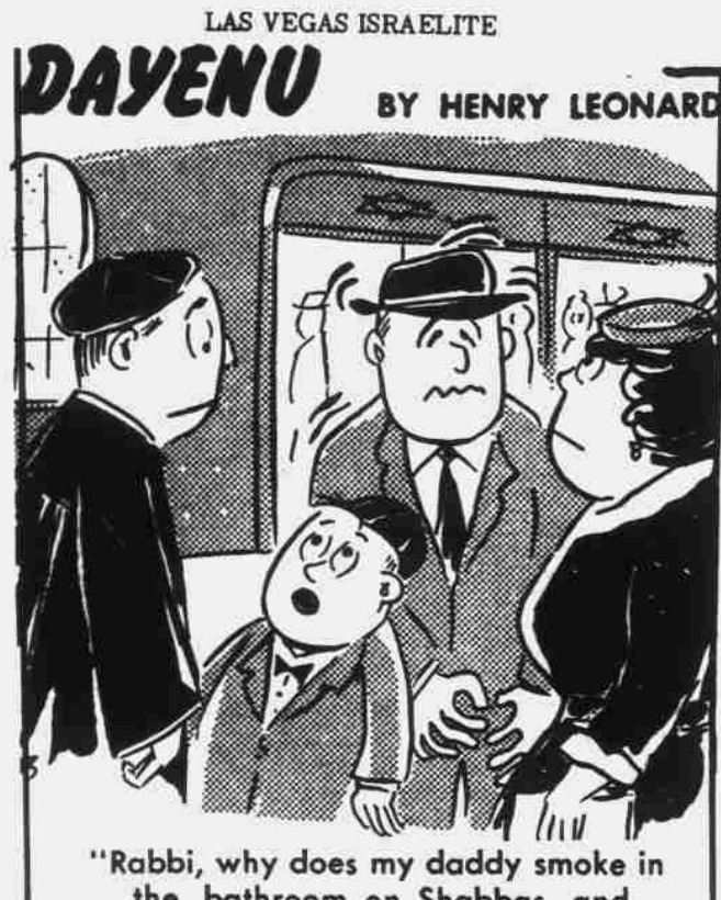
the bathroom on Shabbas, and eat there on Yom Kippur?" Copr. 1961, Dayonu Producti

Opera singer. In a national journal, Mr. Merrill told