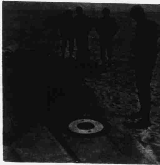
ISRAELI DEFENSE FORCE LOOK AT WING OF DOWNED EGYPTIAN SUKHOI - 7 BOMBER BLASTED OUT OF AIR 5 MILES EAST OF SUEZ CANAL.

Nine of the Arab countries reportedly supported Nasser's war plan. Four wanted to study it further and Kuwait was neutral. Nasser told the conference that Egypt was bearing the brunt of attacks by Israel and demanded that each Arab nation spell out what it was prepared to commit to the struggle. He reportedly quarreled with King Hussein of Jordan, who expressed a liking for the new American initiative which allegedly would return virtually the entire West Bank to Jordan and give Jordan a role in governing Jerusalem. The Syrian, Iraqi and Yemeni delegations boycotted the ceremonial closing session