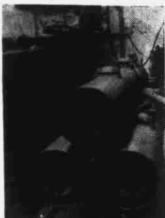
A VIEW OF THE MOGEN DOVIDS ON THE TORPEDO TUBES STORED ON DECK OF USS BRONSTEIN.