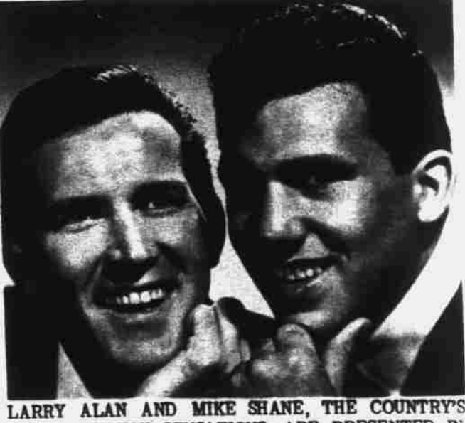
NEWEST LAUGH SENSATIONS, ARE PRESENTED IN THE COMEDY PORTION OF THE DESERT INN'S MIL-LION DOLLAR PRODUCTION OF "PZAZZ "70." THE SUPERSPECTACULAR IS NOW IN ITS 12th RECORD-SMASHING WEEK IN THE HOTEL'S ELEGANT CRY-STAL ROOM.

Everybody should see the Cotton Club Revue at the Castaways, this is a very well executed musical. It is