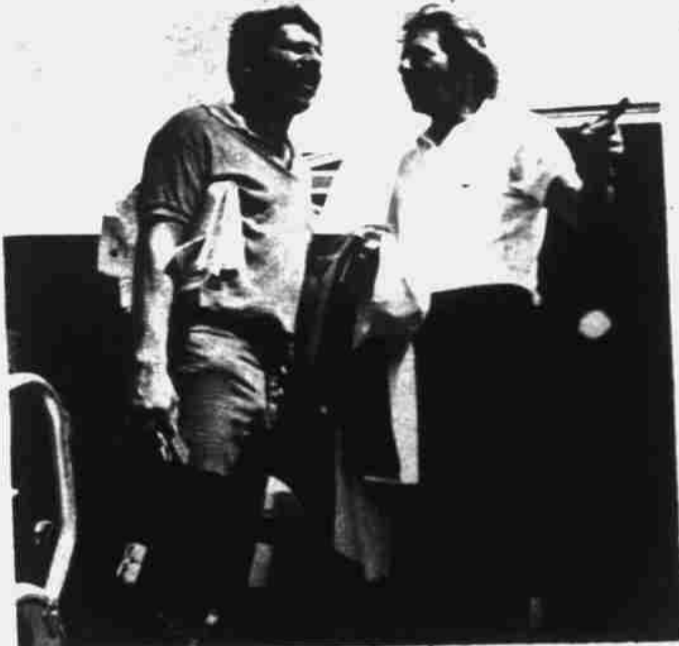
MOVIE STARS DANNY KAYE AND HAIM TOPOL ON A FLYING TRIP TO ISRAEL.