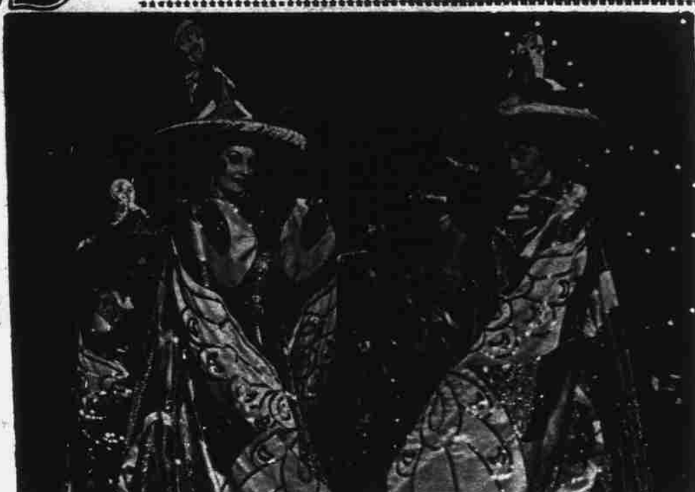
STAGEFUL OF BEAUTIFUL GIRLS IN LAVISH CHINESE COSTUMES DO A SHOW WITHIN A SHOW DURING THE CHICAGO PRODUCTION IN THE DESERT INN'S MIL-LION DOLLAR PRESENTATION OF "PZAZZ '70". THE MUSICAL SUPERSPECTA-CULAR IS SHOWN TWICE NIGHTLY AT 8 P.M. AND MIDNIGHT.

Elvis worked very hard we went upstairs to the Top the night I saw him. As us-O' the Landmark to be pre- ual the girls squealed with