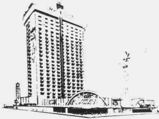
"Biggest Sleeper In Las Vegas"

IT'S KOSHER STYLE PASTRAMI, CORNED BEEF DOMESTIC — IMPORTED BEER OPEN DAILY