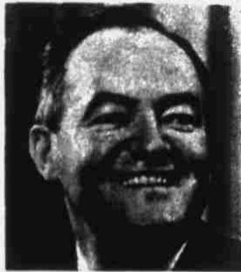
HUBERT H. HUMPHREY Combined Jewish Philanthro- pies. He spoke to some 800 persons.

The former Vice President, senator, and unsuccessful Democratic Presidential candi- date, flew to his Boston suburb from Washington to address the Business Men's Council of the