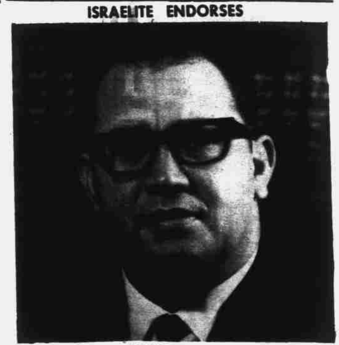
JOHN MENDOZA For Supreme Court Justice

DIDATES THE PAGES OF THIS PAPER ARE OPEN TO