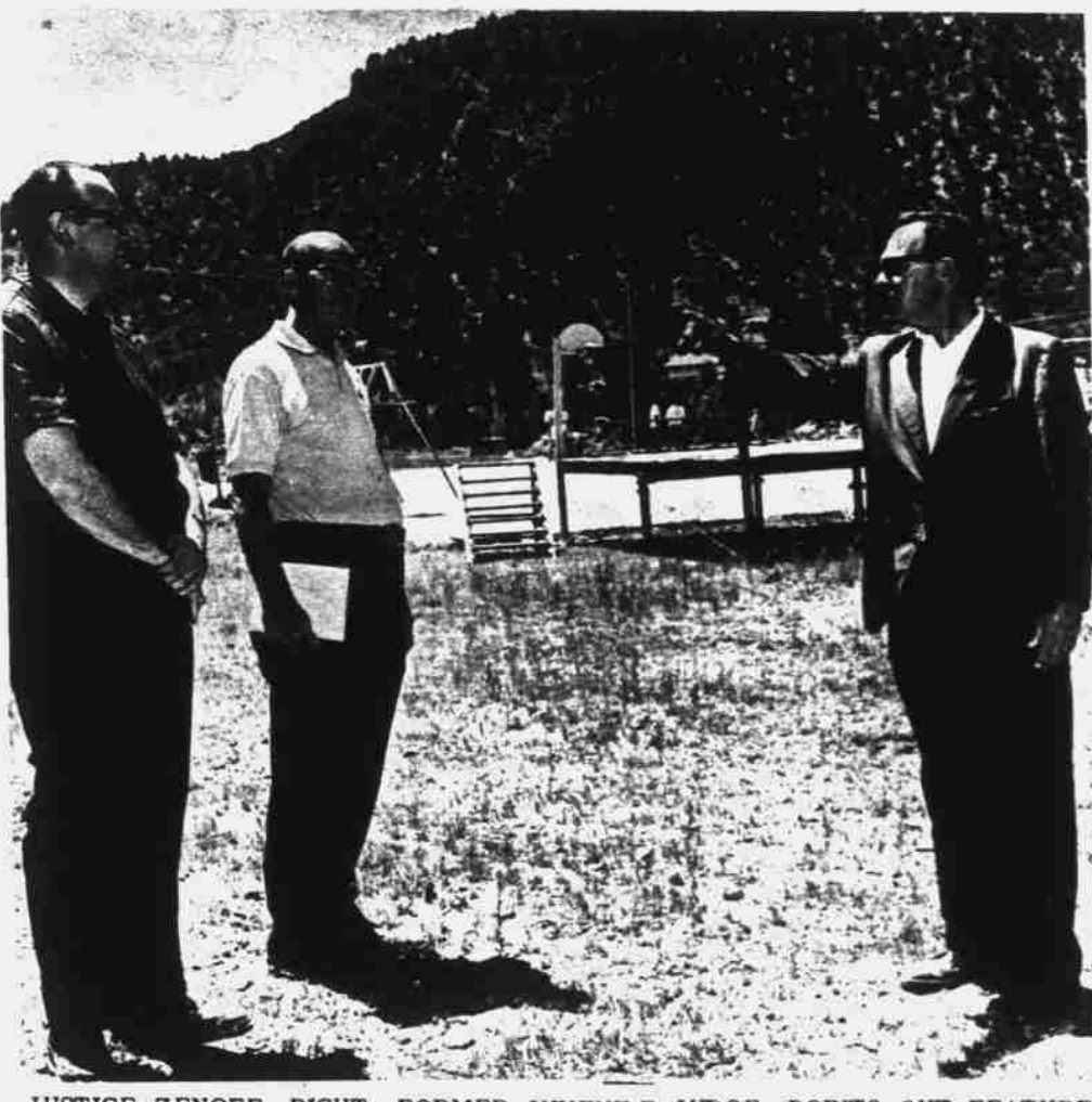
JUSTICE ZENOFF, RIGHT, FORMER JUVENILE JUDGE, POINTS OUT FEATURES TO JUDGE WARTMAN, LEFT, NEW JUVENILE JUDGE, AND SEN, SLATTERY.