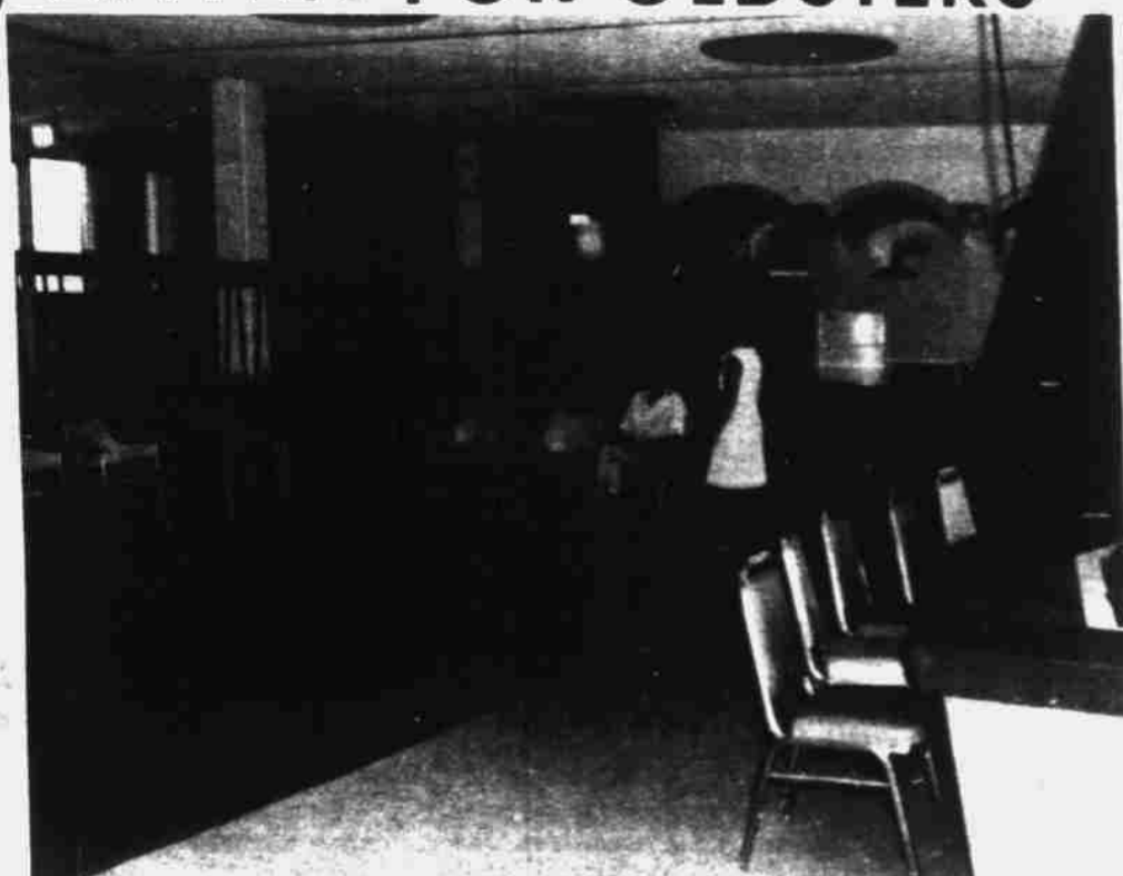
SPACIOUS LOBBY WITH BAR-B-QUE, TV, PIANO, DANCE FLOOR, EQUIPPED KITCHEN, PROVIDES PUBLIC AREA MEETING GROUND.