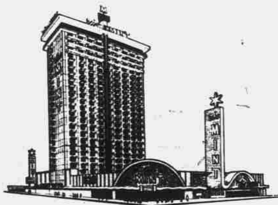
"Biggest Sleeper In Las Vegas"