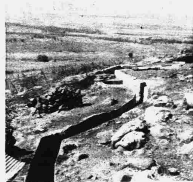
SNAPSHOT TAKEN BY FRANK, OF A SYRIAN TRENCH THAT OVERLOOKED ISRAELI KIBUTZES AND TERRORIZED JEWISH SETTLERS SINCE 1948. IT IS WITHIN YARDS OF WHERE JEWS TILLED THE SOIL AND STRIVED FOR PEACEFUL EXISTANCE. IT IS NOW ON LAND OCCUPIED BY ISRAEL AFTER THE JUNE WAR.

Caesars Palace is to be commended for exquisite service and the tastiest of deluxe dinners.