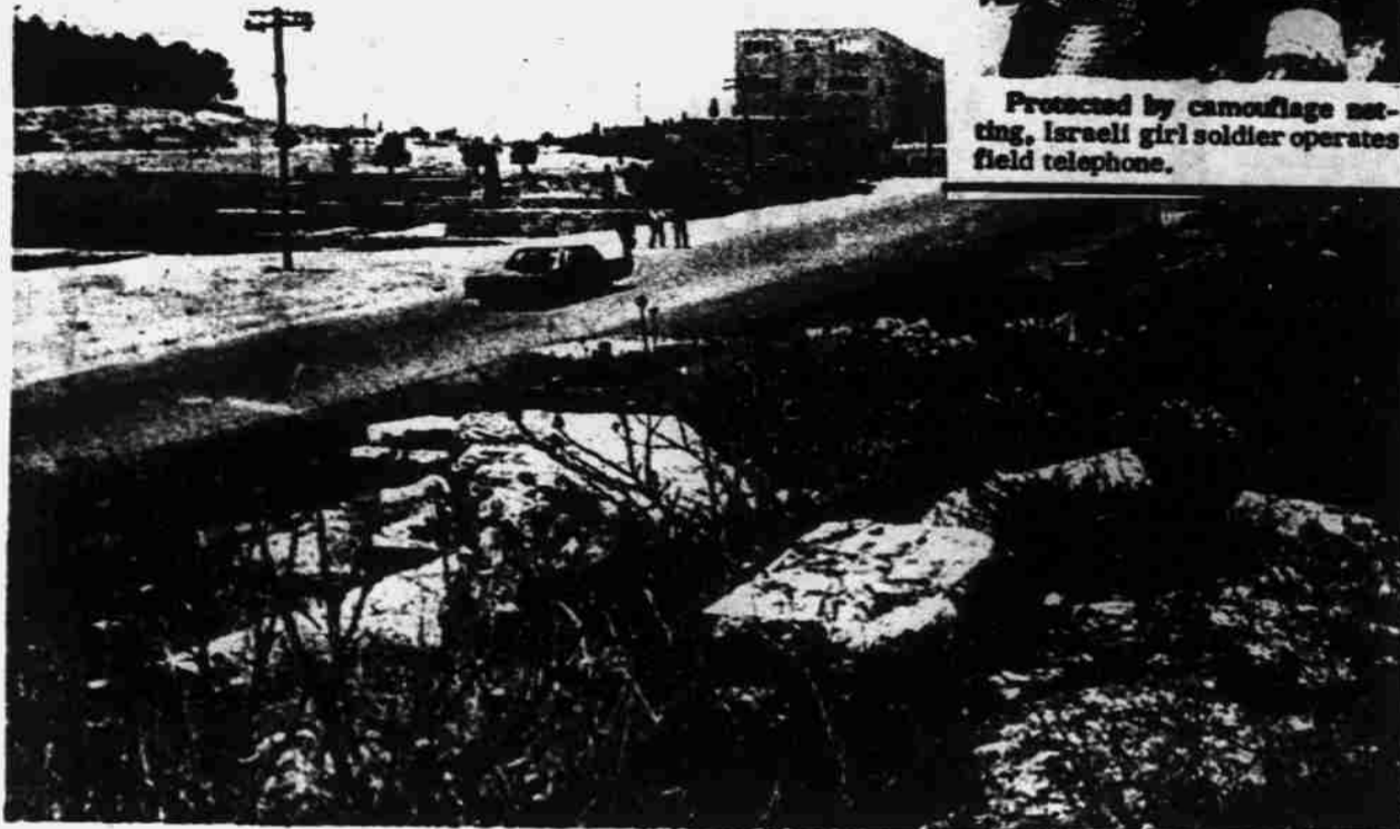
This was a Jewish cemetery on the Mount of Olives before Jordan occupied Old Jerusalem in 1948. Returning