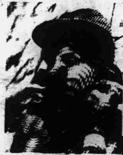
Protected by camouflage netting, Israeli girl soldier operates field telephone.

Without question the most important event of the last Jewish year was the dramatic victory of beleaguered Israel over overwhelming Arab forces in the six-day war last June. Here are some memorable scenes from the fighting.