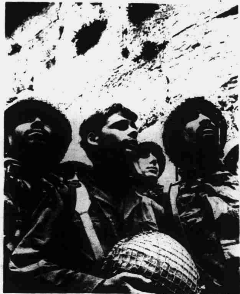
Israeli troops reach the Wailing Wall in Old Jerusalem, the last remnant of the Second Temple, destroyed by the Romans and symbolizing the 1900-year Exile of the Jews from the Holy Land.

MARKET 4101 W. CHARLESTON LAS VEGAS, NEV.