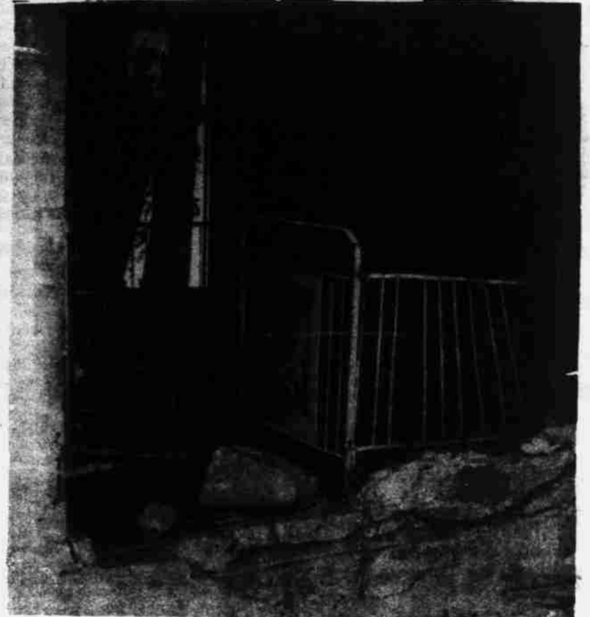
Children's room in kibbutz after being shelled by Syrian troops.