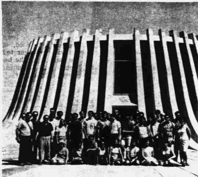
NATIONAL BAR MITZVAH CLUB MEMBERS ATTEND SPECIAL TREE PLANTING CEREMONY AT JOHN F. KENNEDY MEMORIAL FOREST IN ISRAEL.

IF YOUR BUSINESS CANNOT AFFORD TO ADVERTISE THEN ADVERTISE IT FOR SALE IN THE LAS VEGAS ISRAELITE.