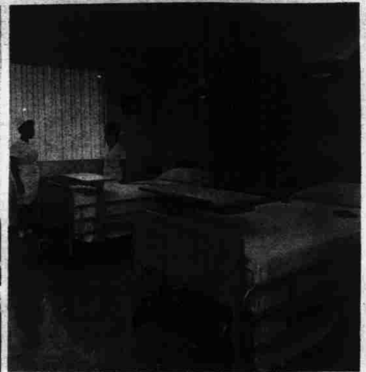
TWO-BED ROOM WITH EVERY CONVENIENCE.