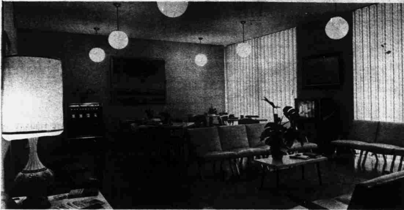
SPACIOUS, PLEASANT, CHEERFUL SOCIAL HALL WHERE RESIDENTS CONGREGATE TO SOCIALIZE.