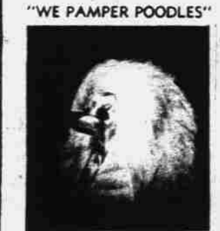
Champion Toy at Stud

TOY PUPPIES GROOMING BOARDING 1800 SO. MAIN STREET Tel. 382-5861