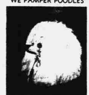
Champion Toy at Stud

TOY PUPPIES GROOMING BOARDING 1800 SO. MAIN STREET Tel. 382-5861