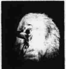
Champion Toy at Stud

TOY PUPPIES GROOMING BOARDING 1800 SO. MAIN STREET Tel. 382-5861