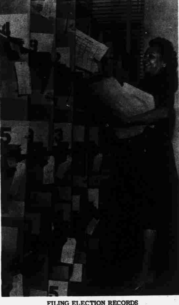
FILING ELECTION RECORDS

She is a member of Latter Day Saints Church and served as a missionary in Min-