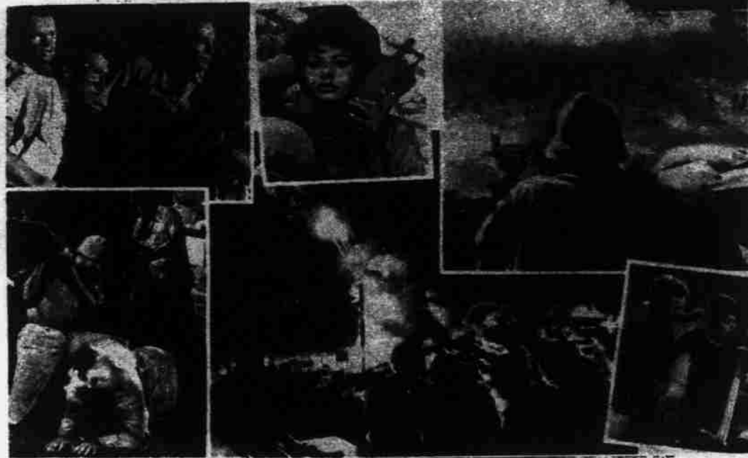
"JUDITH"—A STORY OF PASSION, WAR, REVENGE

However, when the cameras stopped rolling, the dancers didn't. They continued dancing far into the night as if they didn't have an enemy within a thousand miles.