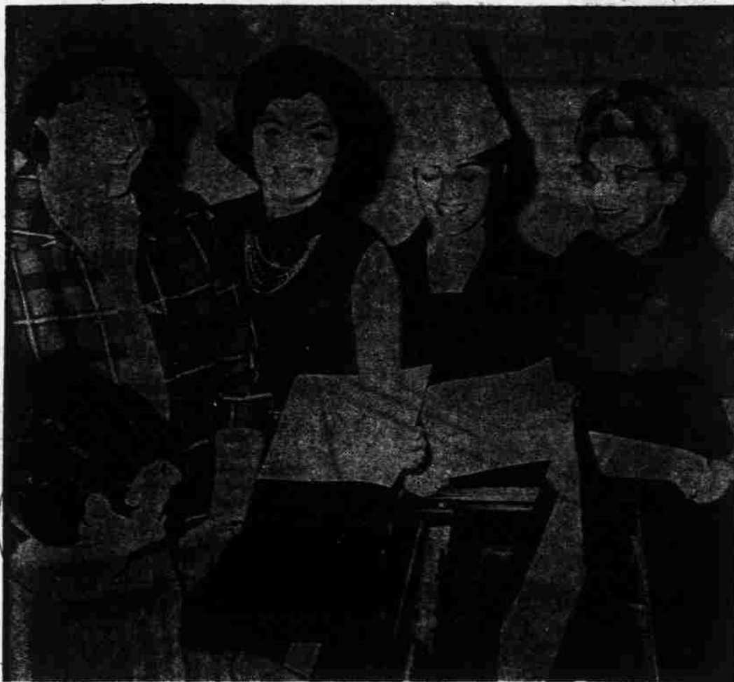
B'NAI B'RITH BALL CHAIRMEN