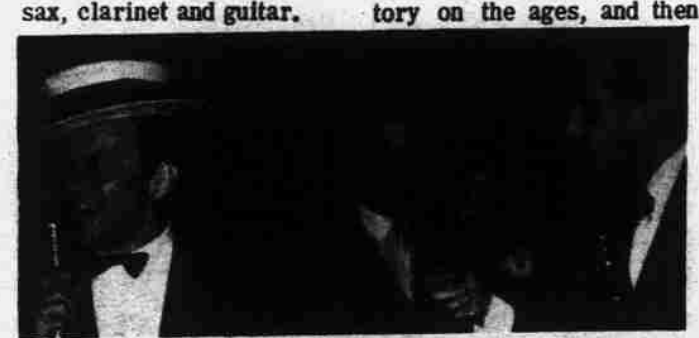
DAVE AND SINATRA