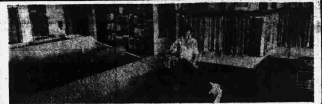
FRAN AND ORLAND HARRIS' SHOWROOM 301 SOUTH HIGHLAND, NEXT TO WALKER'S FURNITURE