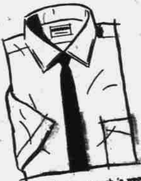
Arrow's Duster, wash 'n wear broadcloth, short sleeve, 4.99

Batiste, short sleeve, 5.99 Broadcloth, short sleeve, 5.95 Decton, long sleeve, 6.95