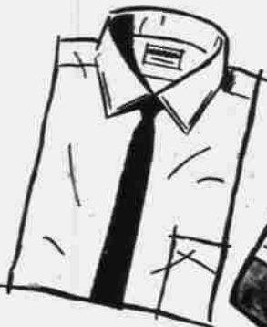
Arrow's Foreway Club, wash 'n wear spin dry, short sleeve, 5.99

DECTOLINE . . . ultra smooth 100% Dacron polyester. Iron never needs even touch-up ironing. Dries in less than 2 hours, without 3 ordinary shirts. Short Sleeve 7.95 Long Sleeve 8.95