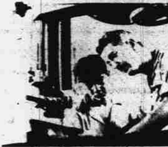
Train Jewish youths in Israel and elsewhere in crafts and trades.