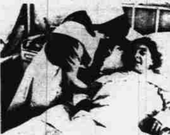
Add life to the years of the sick and aged among Israel's newcomers.